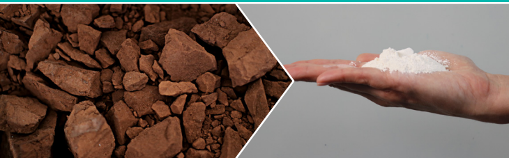
Ash2Phos produces high-grade calcium phosphate from sewage sludge ash.

EasyMining's patented Ash2Phos process extracts more than 90 percent of the phosphorus present in incinerated sewage sludge ash. It's a truly circular method whose quality, volumes and reliability meet commercial uptake demands. The first full-scale plant in Schkopau, Germany, is projected to treat 30,000 tons of ash per year.